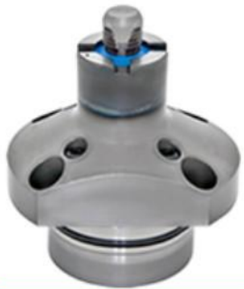
CGC Series Expansion Clamp